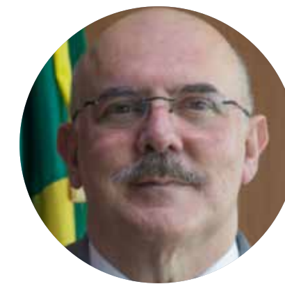
MILTON RIBEIRO Minister of Education, Government of Brazil