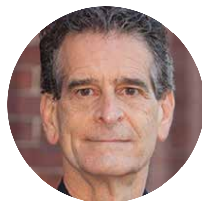
DEAN KAMEN Creator of Segway and Founder, FIRST