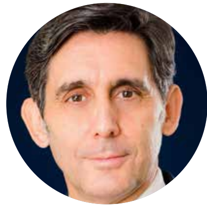
JOSÉ MARÍA ÁLVAREZ-PALLETE Chairman & CEO, Telefónica