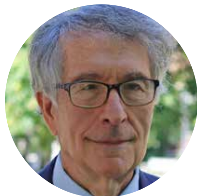
HOWARD GARDNER Hobbs Research Professor of Cognition and Education, Harvard Graduate School of Education