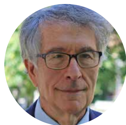
HOWARD GARDNER Hobbs Research Professor of Cognition and Education, Harvard Graduate School of Education