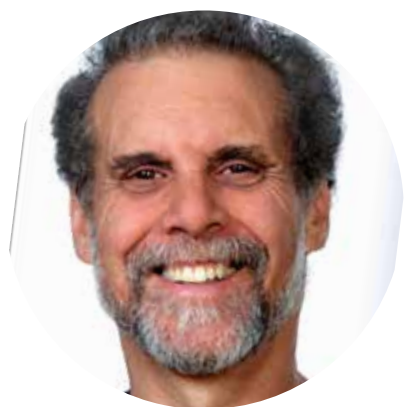
DANIEL GOLEMAN Psychologist and Author of "Emotional Intelligence"