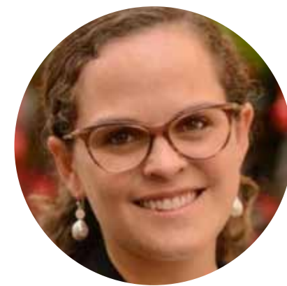
MARÍA BROWN Minister of Education, Government of Ecuador