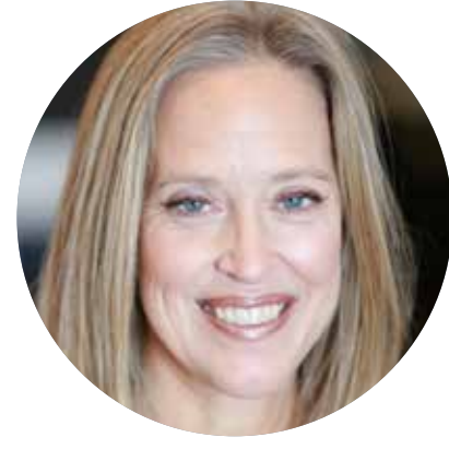
WENDY KOPP CEO and Co-Founder, Teach For All