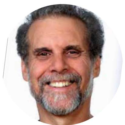
DANIEL GOLEMAN Psychologist and Author of "Emotional Intelligence"