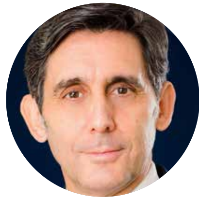
JOSÉ MARÍA ÁLVAREZ-PALLETE Chairman & CEO, Telefónica