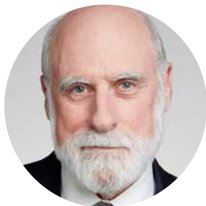
VINTON CERF Vice President, Chief Internet Evangelist of Google and co-Founder of the Internet Society