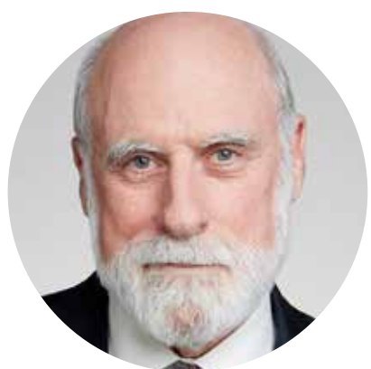
VINTON CERF Vice President, Chief Internet Evangelist of Google and co-Founder of the Internet Society