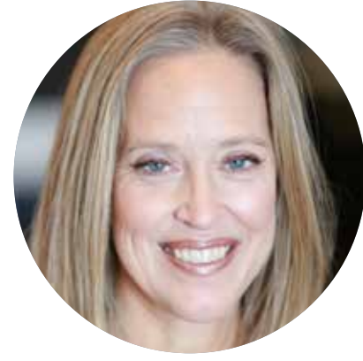
WENDY KOPP CEO and Co-Founder, Teach For All