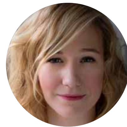
LINDA LIUKAS Coder, entrepreneur, children's writer and illustrator