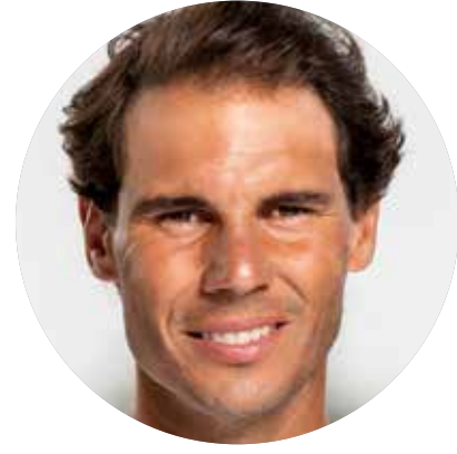
RAFAEL NADAL Professional Tennis Player